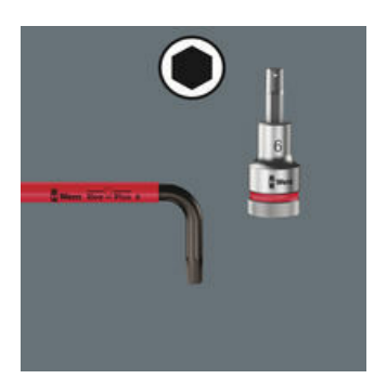
Take it easy tool finder system with profile and size colour-coding for quick and easy tool selection. Colour-coded system for hexagon drive screws (L-Keys, Zyklop bit sockets), external hex drive screws and nuts (Joker wrenches, Zyklop sockets and Zyklop bit sockets with holding function), and TORX® drive screws (L-Keys, Zyklop bit sockets).