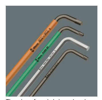
The size of each L-keys has been engraved by a laser. In addition Take it easy L-keys have a colour coding according to sizes - for simple and rapid accessing of the required tool. Making it easy to find the right tool.