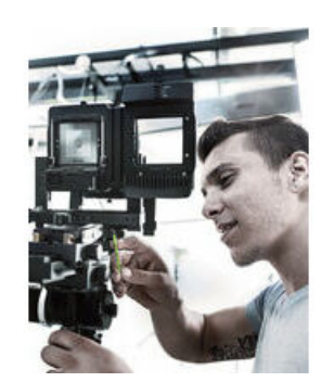
Holding function for recessed TORX® screws