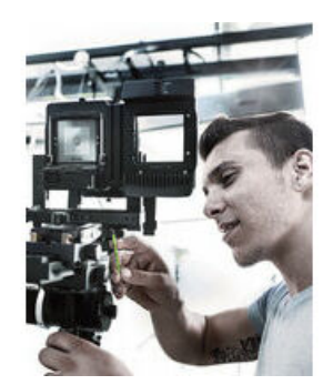
Holding function for recessed TORX® screws