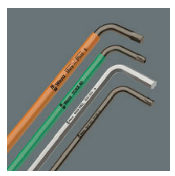
The size of each L-keys has been engraved by a laser. In addition Take it easy L-keys have a colour coding according to sizes - for simple and rapid accessing of the required tool. Making it easy to find the right tool.