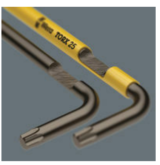
L-keys with a thermoplastic sleeve are manufactured out of easy-togrip, circular material. The sleeve ensures that work is safe and comfortable even at low temperatures. High corrosion protection features thanks to the special BlackLaser surface treatment. Colour coding and large stamp to enable the desired L-key to be easily located.