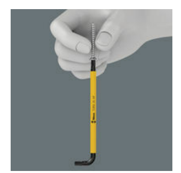
The HF tools developed by Wera are ideal because they feature an optimised geometry of the original TORX® profile. The wedging forces resulting from the surface pressure between the drive tip and the screw profile mean that TORX® screws made according to Acument Intellectual Properties specifications are securely held on the tool!

Holding function for recessed TORX® screws