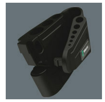
The wear-resistant clip material ensures that the L-keys are securely held yet are easy to remove.