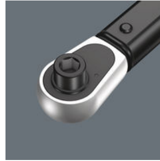
With 1/4" hex drive.

We wanted working with torque wrenches to be simple and accurate which is why we developed the Click-Torque wrenches. With the ability to set and save the default values and with the unmistakable, robust Wera design, these torque wrenches are the ideal tools for all bolting applications that require torque-controlled tightening (clockwise torque wrenches) and tightening and loosening (torque wrenches for insert tools).