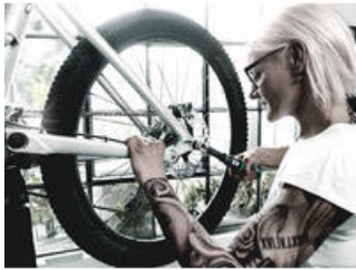
Click-Torque A 6