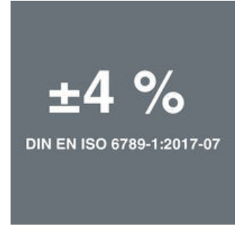
Precise to \pm 4\% as per DIN EN ISO 6789-1:2017-07.