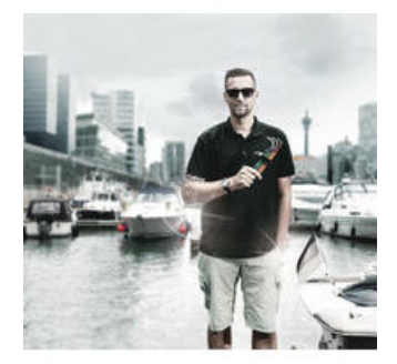
We questioned the classic L-key design, since all too often the screw head recess is rounded out, meaning screws can no longer be tightened or loosened - and so the user finds the L-key slipping out of the recess. Wera Hex-Plus tools have a larger contact surface in the screw head. The notching effects are reduced and thereby the deformation of the screws. At the same time, as much as 20 %more torque can be applied.