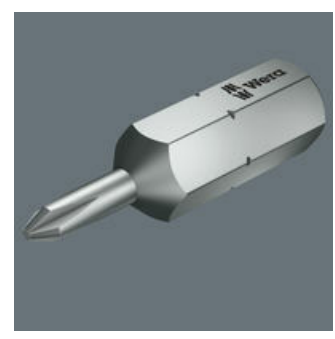
J stands for Japan. J bits have been optimised to suit Asian PH screws. In particular, they are for use with very small dimensions as set out in the Japanese Camera Standard.