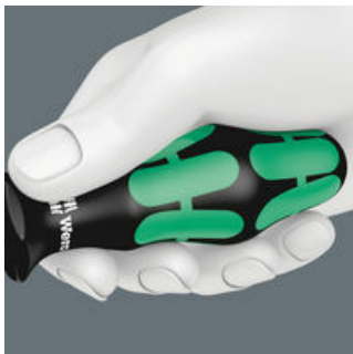
Large contact area

The large contact area – with particularly high friction to the soft zones – results in high torque transfer without any bruising from the edges.