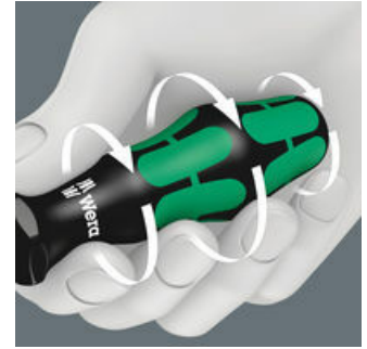
Rapid hand repositioning

The hard materials used for the handle ensure rapid hand repositioning without any danger of the skin "sticking" to the handle. The surrounding hard zones with large diameters glide like wheels across the hand.