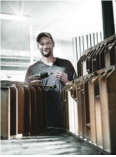
Bits with reduced shaft diameter