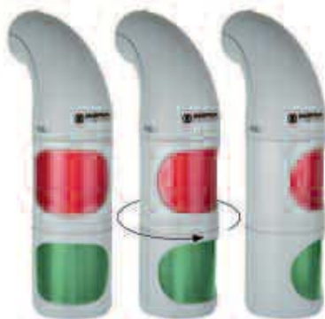
The direction of the optical signal can be individually adjusted