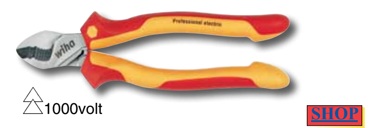
Insulated ∠1000volt 64HRC cutting edges