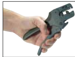
Ergonomic design with non-slip two component handles