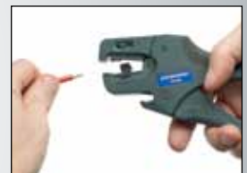
Easy/snag free wire removal from tool - jaws stay open after strip