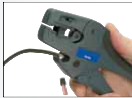
Cuts & strips up to 10mm 2 /8 AWG - Strips PVC, THHW, TEFLON insulations