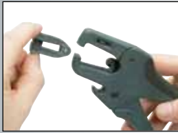
Interchangeable stripping blade cassettes