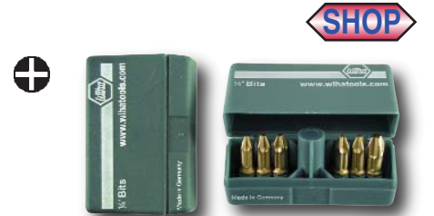
711 96 PokitPak - Phillips TiN Coated Insert Bits In Molded Case -