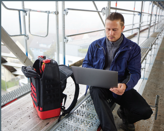
With the protected laptop compartment, you have your entire office along with you everywhere.