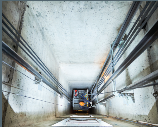
When working on difficult-to-access spots such as lift shafts.