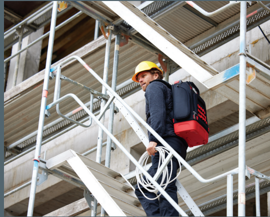
Leaves the hands free at all times, to transport additional material, for example.