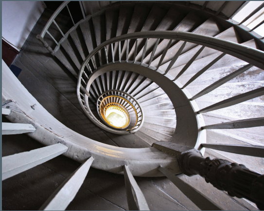
Ideally suited for jobs in buildings without lifts, e.g. in old buildings.