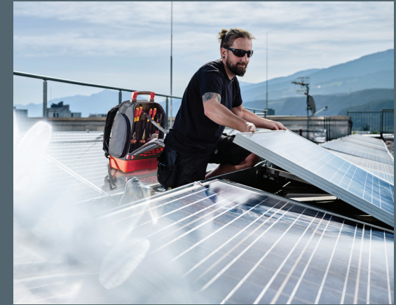
Convenient for working on roofs, such as solar heating system construction.