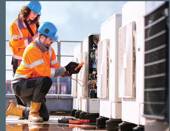
Installation and maintenance of air conditioning on the roof.