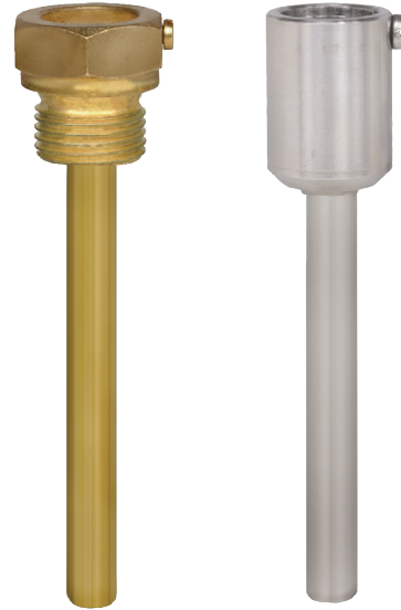
Fig. left: Protection tube with thread, model SWT52G Fig. right: Protection tube with welding stud, model SWT52S