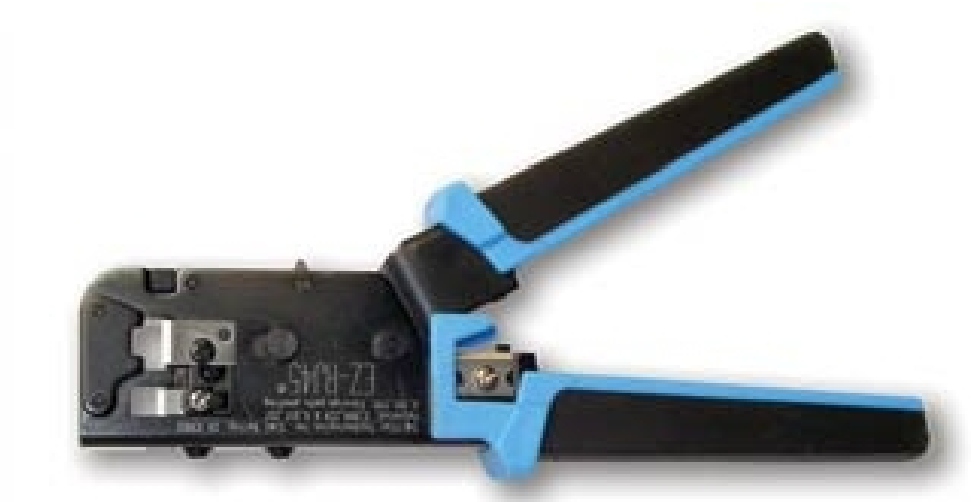
BD45000 Crimp & Trim Tool