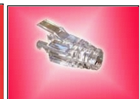
CXB500/600 Snagless Boot