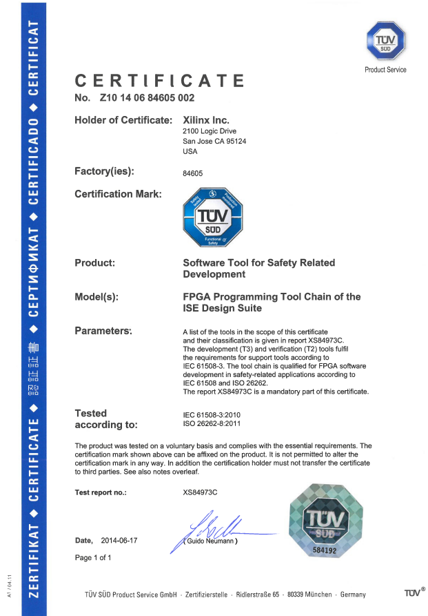
Figure 2: Certification