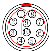
Welded surface (焊接面)