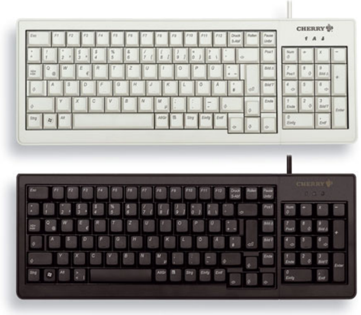
Models may vary from the image shown