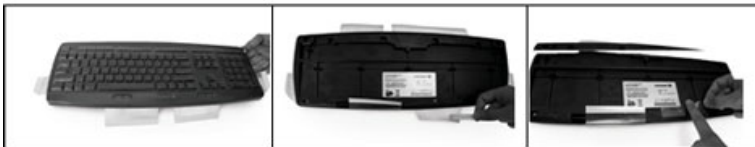
Models may vary from the image shown